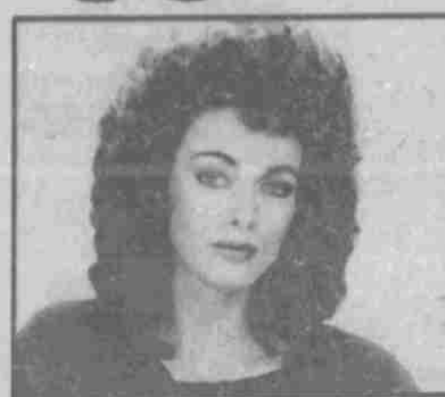
Directives Perm Special 822.50

The Silver-Haired Unicameral will need to weigh all 19 bills against one another to determine a list of priorities.