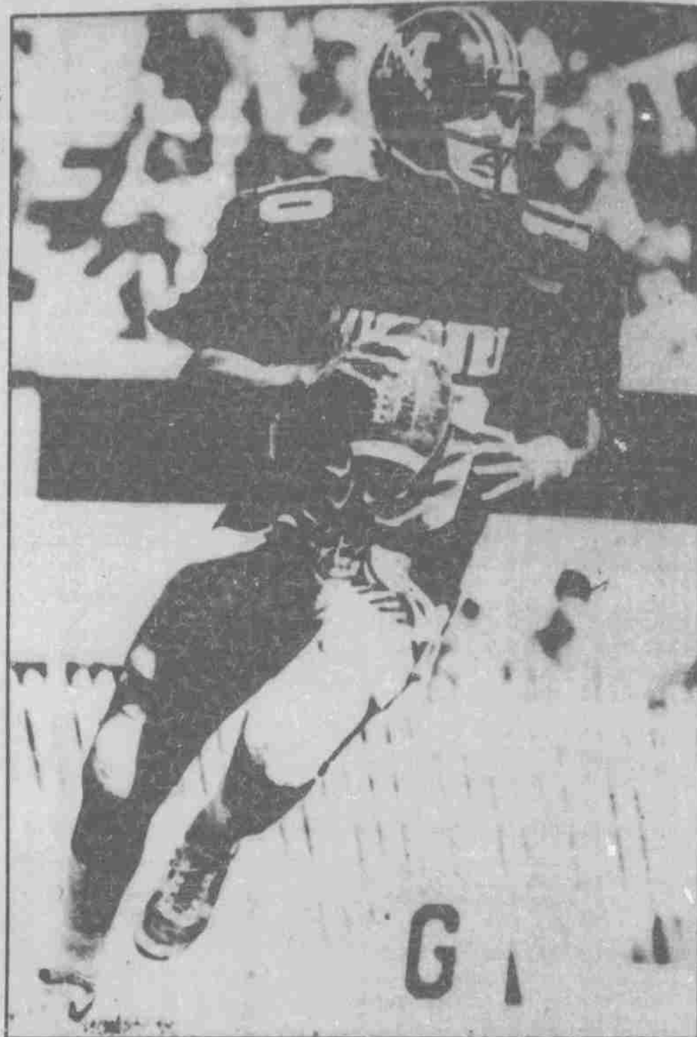
Big Eight Services