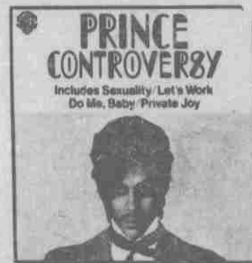
$5.79 Every Day Low Price