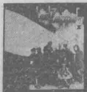
$5.79 Every Day Low Price