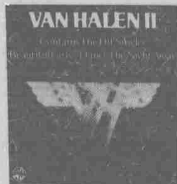
$5.79 Every Day Low Price