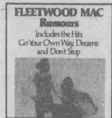
$5.79 Every Day Low Price