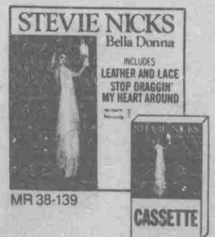
$5.79 Every Day Low Price

Look For Nebraska's Best Album Prices, Always At Pickles.