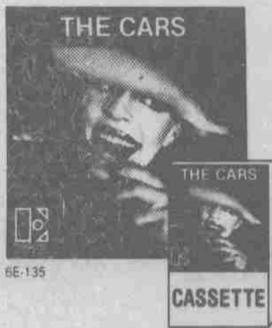
$5.79 Every Day Low Price