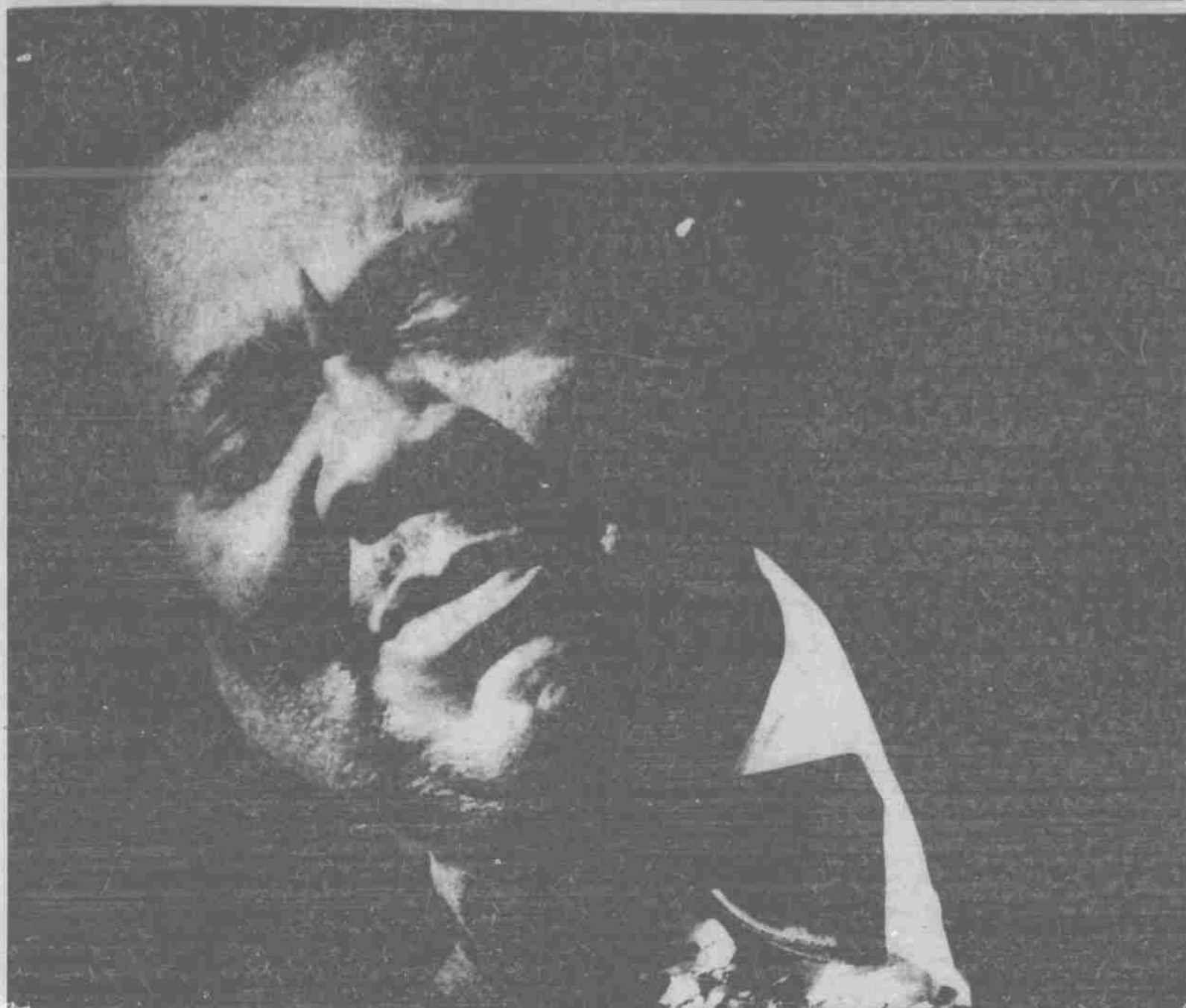
Jazz artist Jay McShann of Kansas City is slated to play two nights at the Zoo Bar.