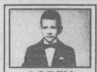
Congratulation, you're No. 1 in our hearts and lives.