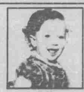
We are proud to have you for a daughter. Congratulations. Love, Mom & Dad