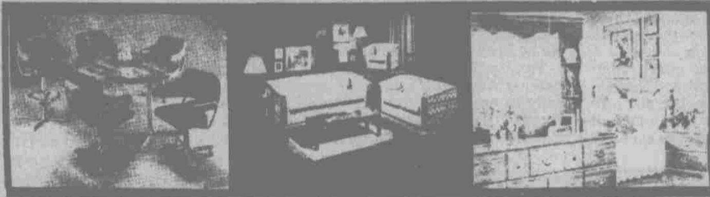
DINETTE LIVINGROOM BEDROOM

ENOUGH FURNITURE TO FILL YOUR ENTIRE HOUSE OR APARTMENT WITH QUALITY MODERN STYLING FOR ONLY