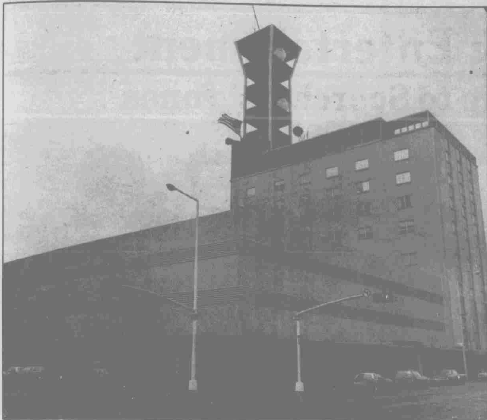
The City Bank building, 14th and M streets, is one of seven downtown areas which may be declared blighted in a $30,000 study. Gold's Galleria, 12th and O streets, (left) declared blighted two years ago, currently is being renovated.