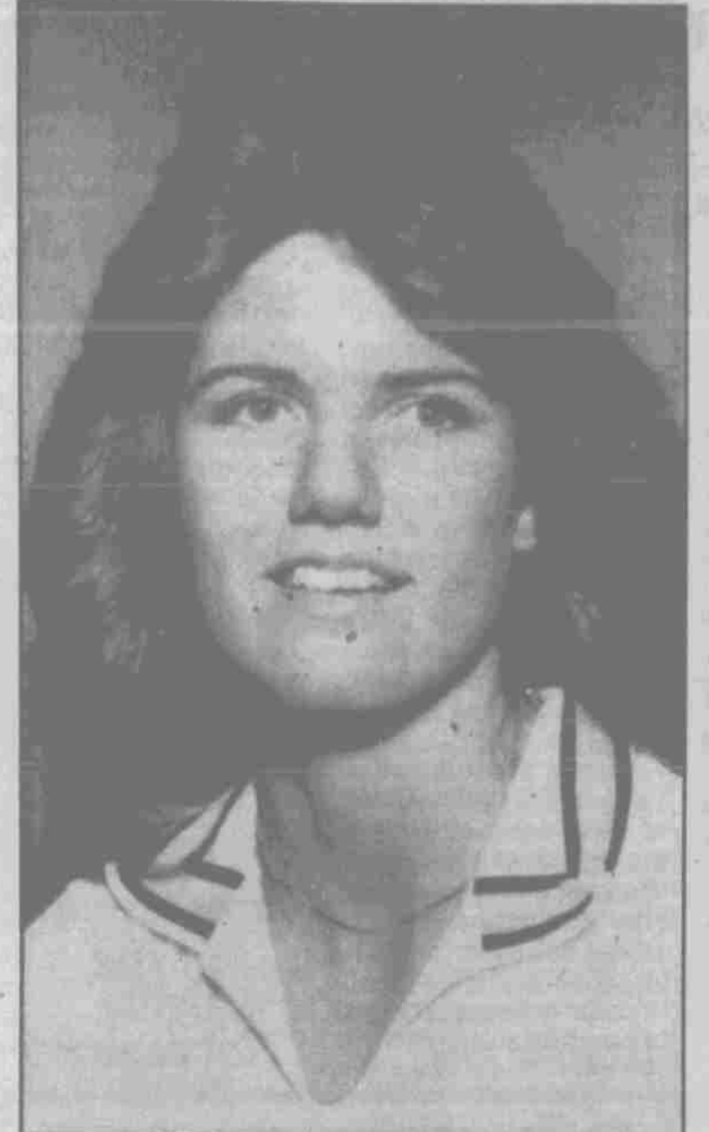
Missouri Sports Information