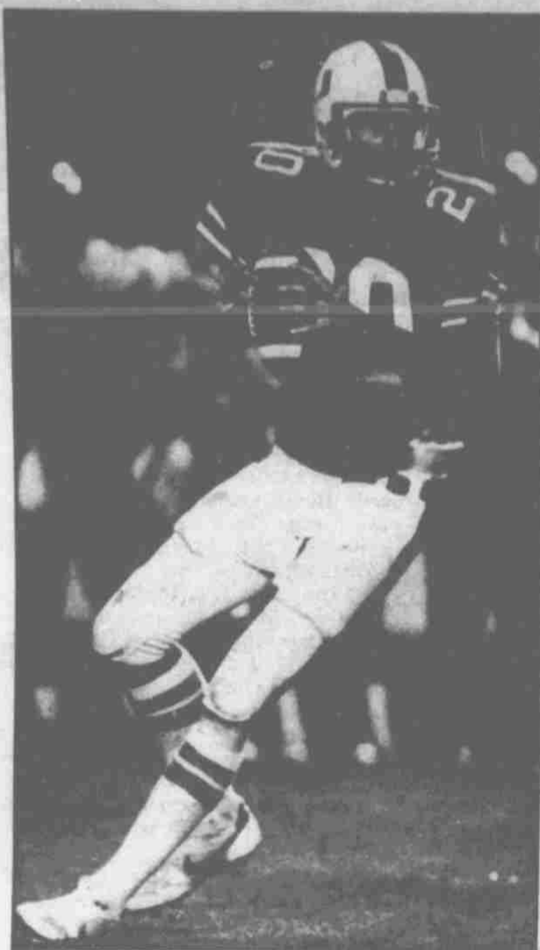
Bernie Kosar in his natural habitat: fading back to pass.