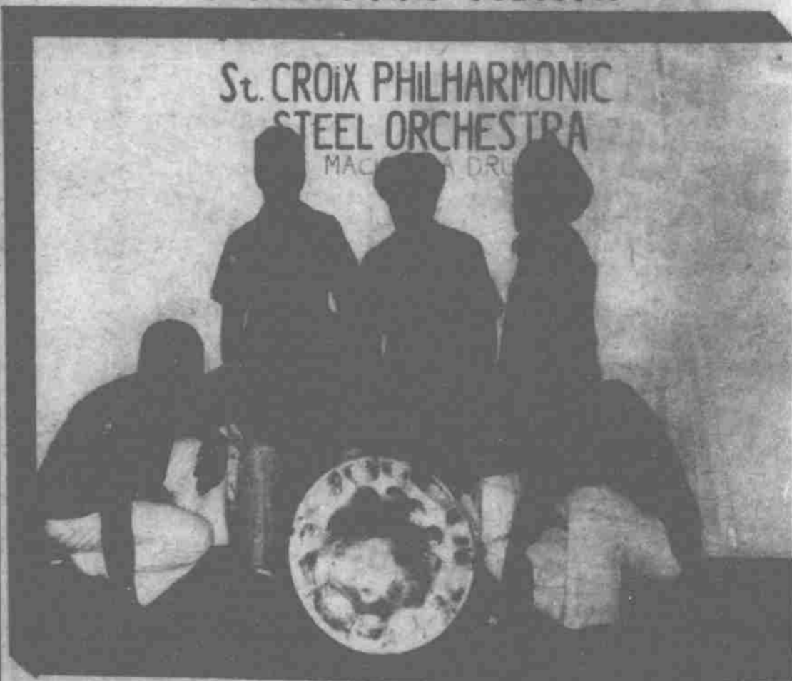
From THE VIRGIN ISLANDS