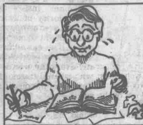
Figure 10.5 Student studying and not earning money. (Bad economic planning.)

You can earn up to $100 per month by donating plasma. And since you can study while you donate, it's like being PAID TO STUDY.