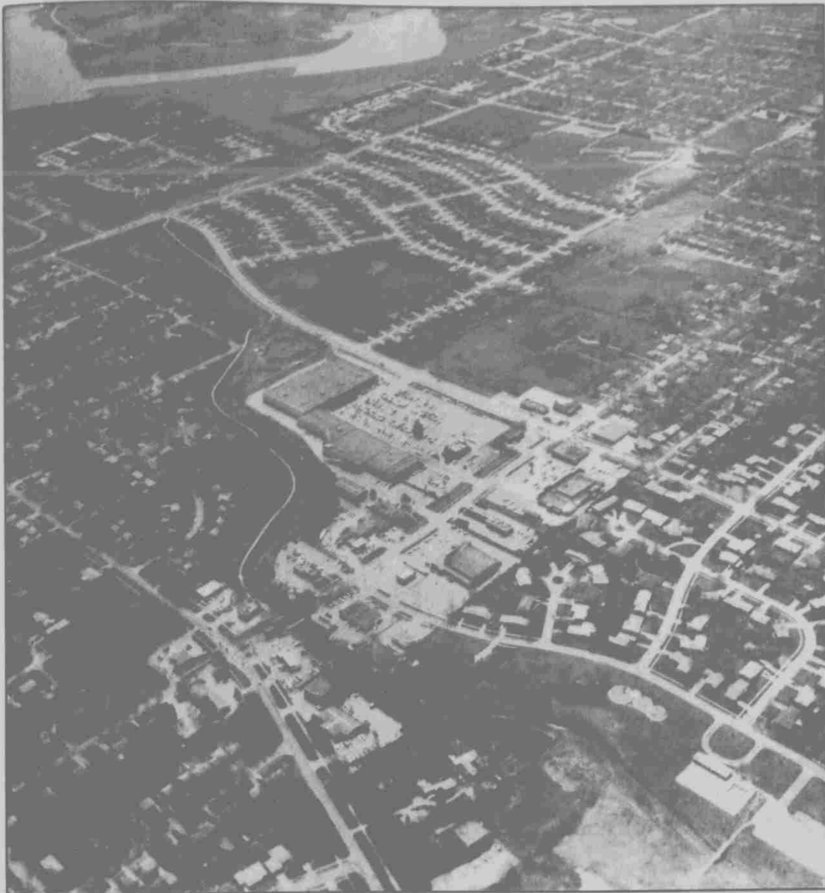
A view of southeast Lincoln from the air.