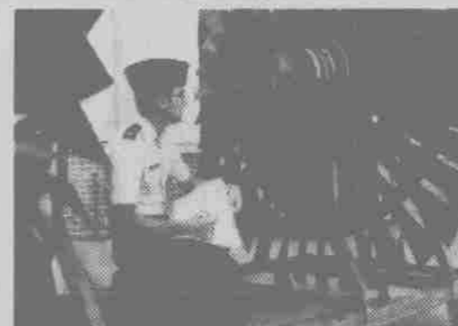
Air Force mechanical engineer inspecting aircraft jet engine turbine.

Most Air Force engineers have complete project responsibility early in their careers. For example, a first lieutenant directed work on a new airborne electronic system to pinpoint radiating targets. Another engineer tested the jet engines for advanced tanker and cargo aircraft.