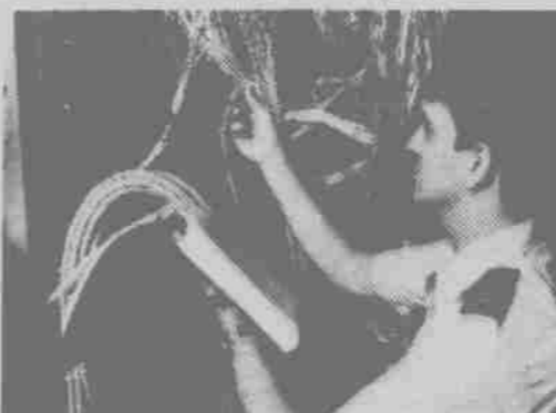
Air Force electrical engineer studying aircraft electrical power supply system.

Engineering opportunities in the Air Force include these eight career areas: aeronautical, aerospace, architectural,