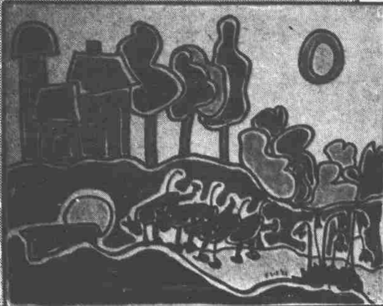
"Dancing Cows" by Janelle Lenser-Schultz

Sosso's wire sculptures and mobiles use wire, scrap metal and shellacked tissue to render sketches three-dimensional. He, and the others, prove that cartoons aren't for kids only.