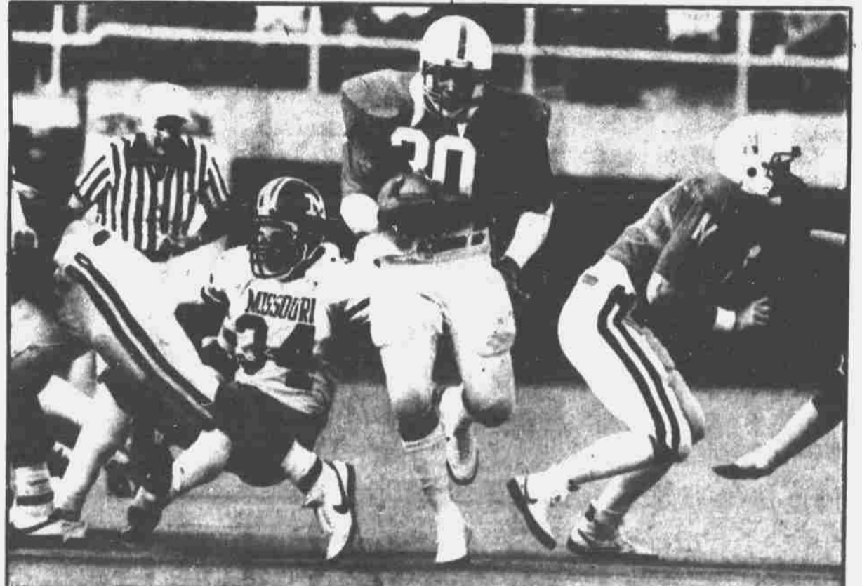
Nebraska I-back Mike Rozier (30) finds an opening to run through in Saturday's 23-19 Big Eight Nebraska win against Missouri in Memorial Stadium. Rozier was Nebraska's leading rusher with 139 yards in 17 carries.