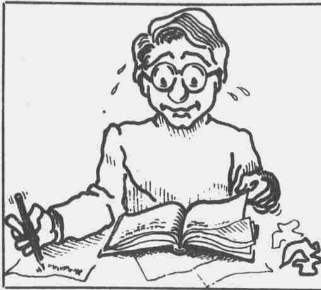
Figure 10.5 Student studying and not earning money. (Bad economic planning).

You can earn up to $95 per month by donating plasma. And since you can study while you donate, it's like being PAID TO STUDY.