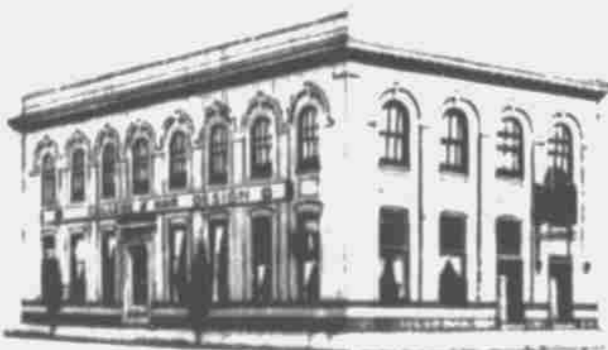
Lincoln's Corner on Hairstyling"