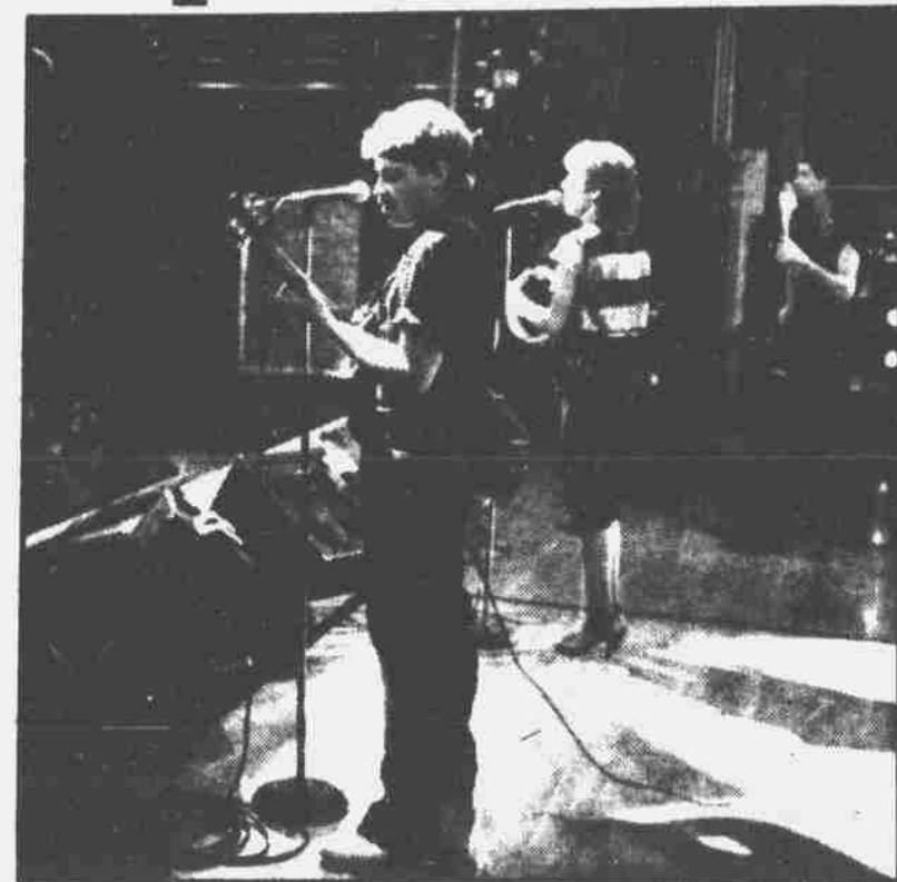
The Star City Players perform at the Phi Gam Jam benefit.