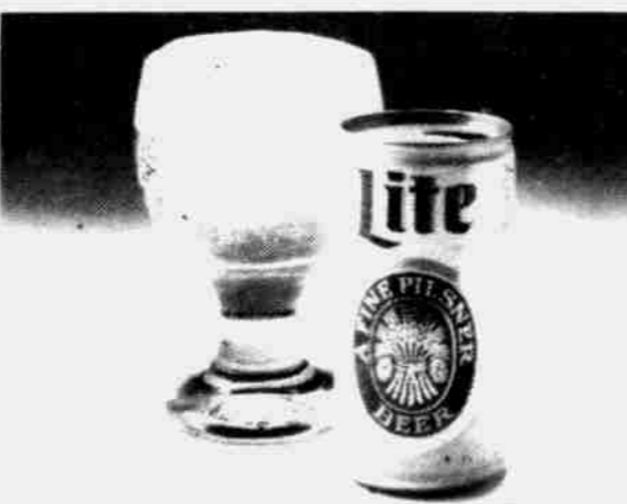
LITE BEER FROM MILLER. EVERYTHING YOU ALWAYS WANTED IN A BEER. AND LESS.

THE COIN TRICK This one drives people nuts. Place a ball on the head spot. With the chalk, make a circle around it, approximately 8" in diameter. Then put a quarter or half-dollar on top of the ball. (Yes, you can use the same one from before, or you can write home to your parents again.) Place the cue ball behind the foot line and have your friends try to