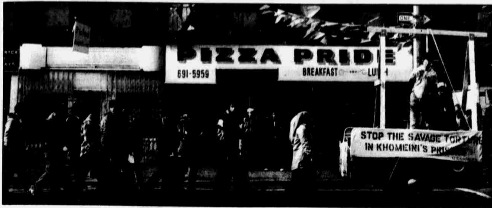
(Right) Demonstrators chant "The People united, will never be defeated," as New York traffic passes in front of them. (Above) A line of demonstrators follow a staging of a mock execution condemning torture in Iran.