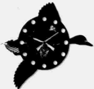
Sportsman Clock Mallard

From The Master Collection, 348 West Prairie Ave., Decatur, Ill.