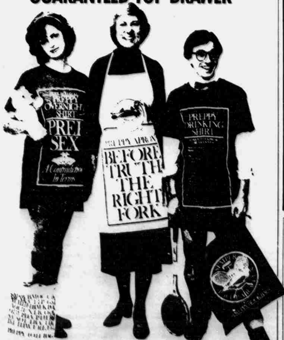
Now available: Official Preppy™ tote bag, night shirt, apron, drinking shirt, book bag. Not shown: Official Preppy Desk Diary 1982 and Official Preppy™ Stationery.