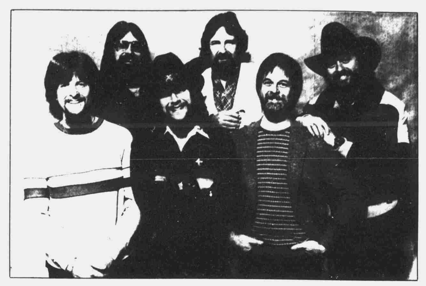
The Marshall Tucker Band