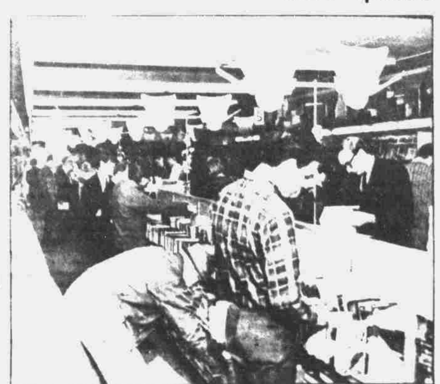
Since the 50's, this has been the next best bargain -tens of thousands of paperbacks and hardbounds at 25 cents to $2.75 and higher.