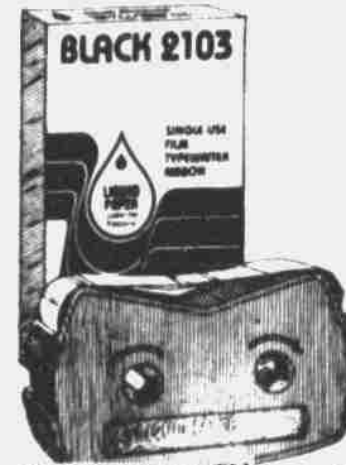
LIQUID PAPER™ Single-Use Film Typewriter Ribbon $2.20