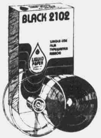
LIQUID PAPER™ Single-Use Film Typewriter Ribbon 80¢