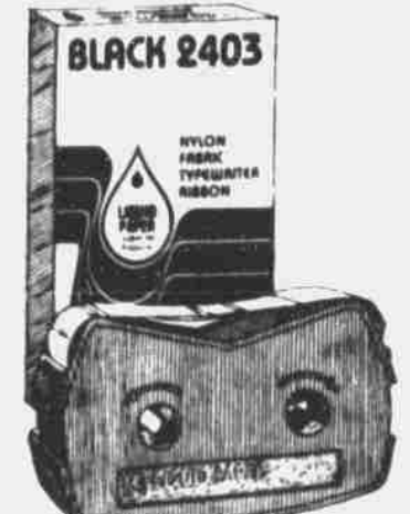
LIQUID PAPER™ Nylon Fabric Typewriter Ribbon $2.50