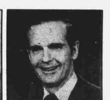
William Proxmire, U.S. Senator

"Reading dynamically is as challenging and stimulating as reading an offense. It is a tremendous technique for gaining understanding on my tight schedule."