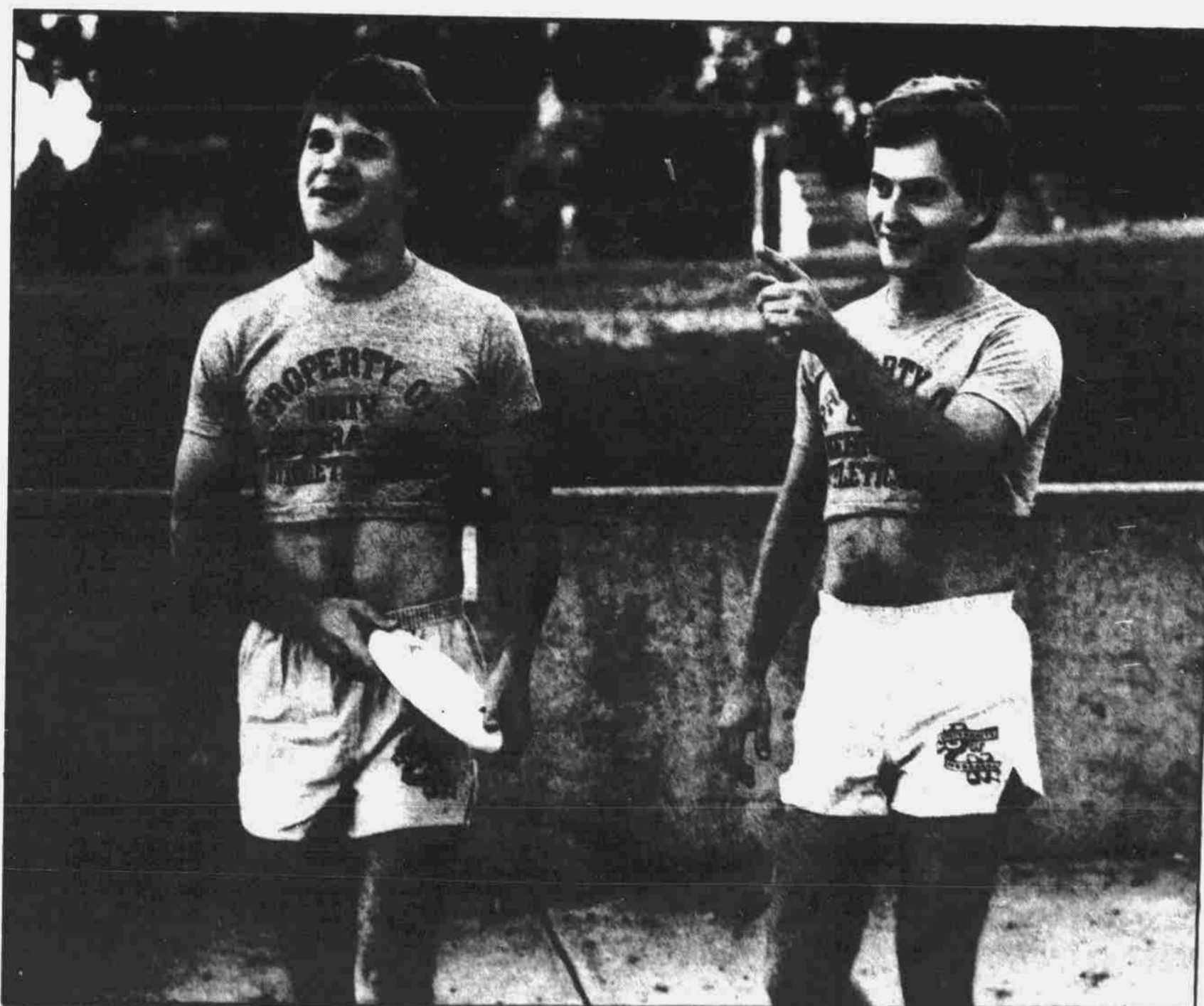
ACTIVE... That describes Big Red and the people who wear Big Red tops and shorts. Two of our favorites are shown here. The oxford gray Schimmel Shirt with red imprinting for $4.95. And the Flannel Gym Shorts also in oxford gray with a v-notched leg for $6.25.

For the Active... with a Touch of Big Red.