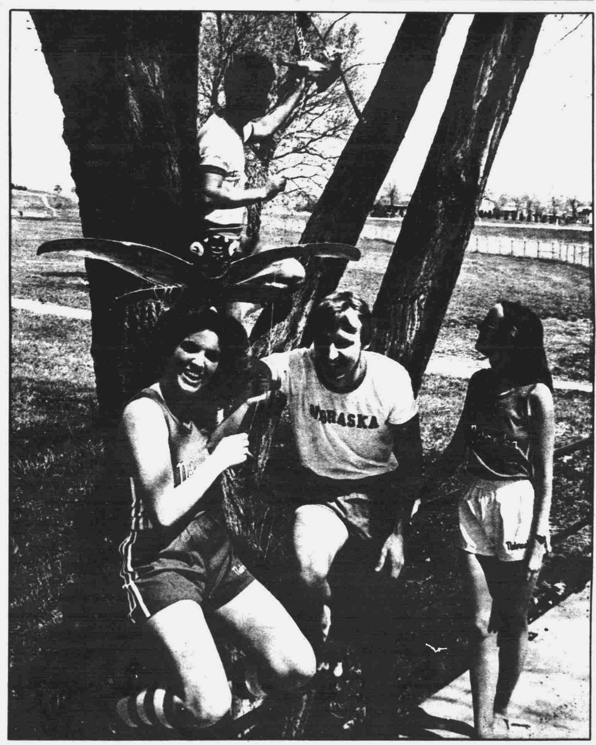
It's Active, It's Red, And it's White, Tank Tops from $6.95. T-Shirts from $5.00. Shorts from $6.95. All from the Big Red Collection.