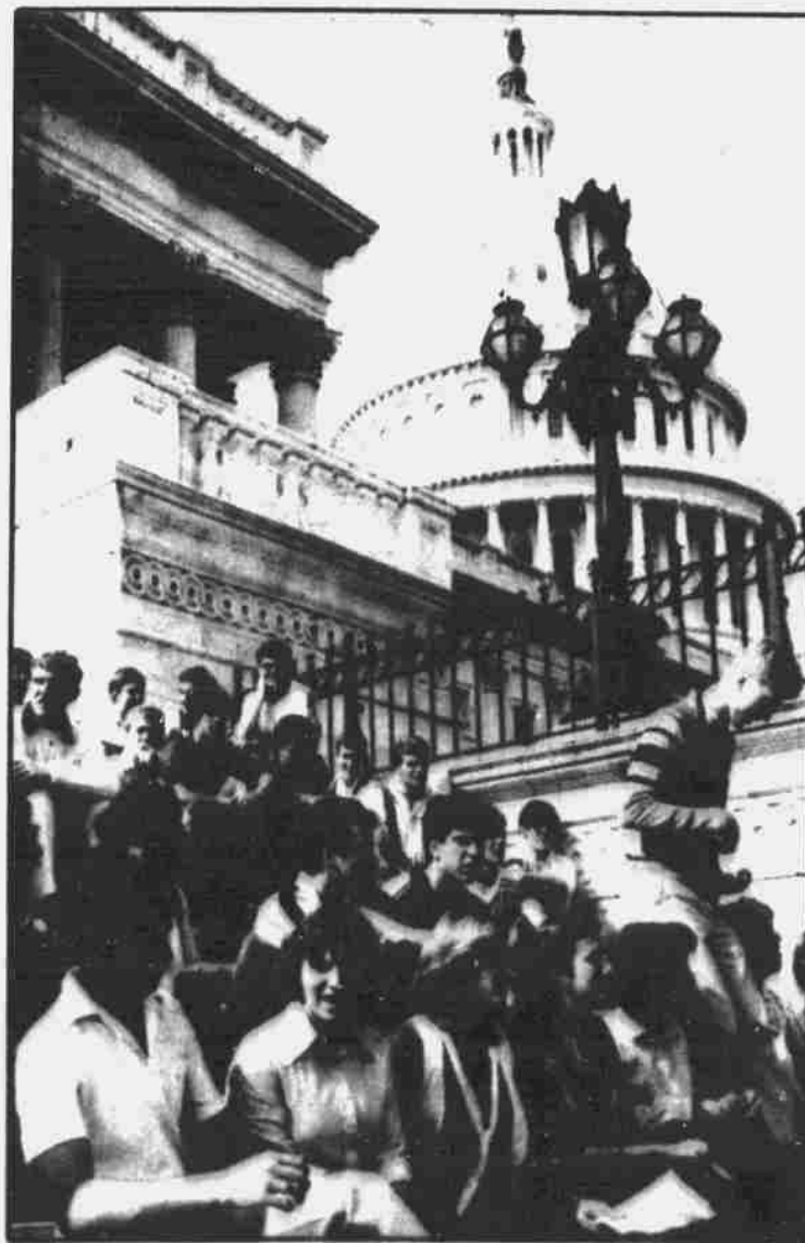
UNL Students—Washington D.C.