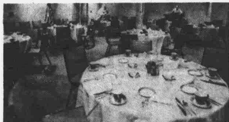
a new love in the heart of downtown Lincoln