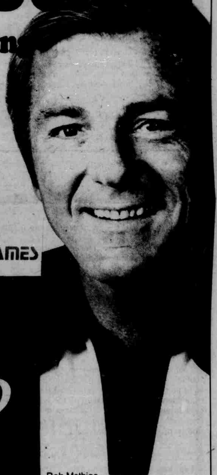
Bob Mathias, Olympic Training Centers Director.

Just donate $1 to the U.S. Olympic Training Centers and this handsome calendar and valuable coupons are yours. With this calendar, you actually get 12 coupons good for $12 worth of Whopper® Sandwiches and Double Cheeseburgers. Each calendar page also portrays an Olympic event, with helpful training tips and Olympic facts.