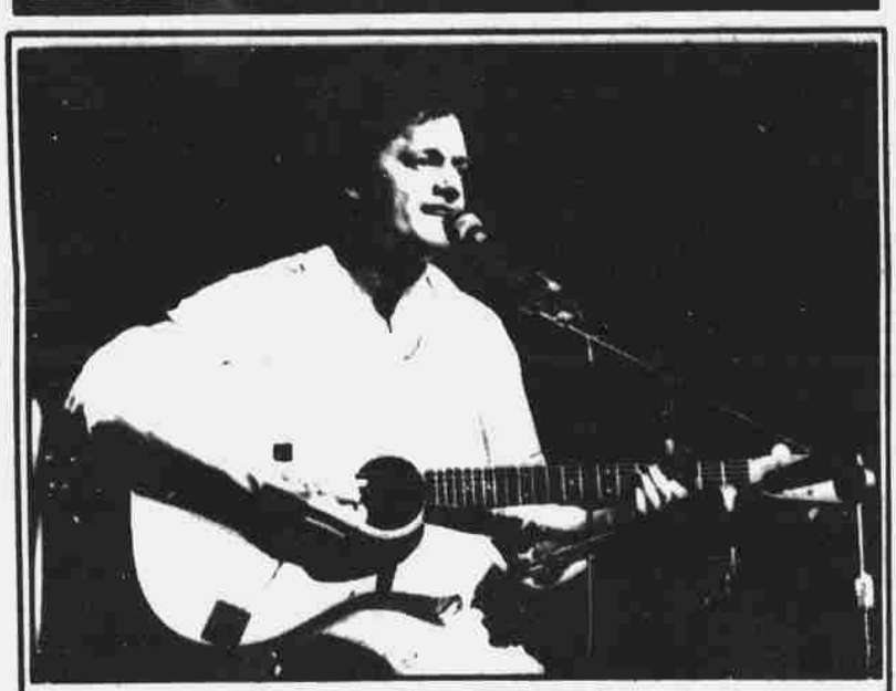
Front Row Productions Presents