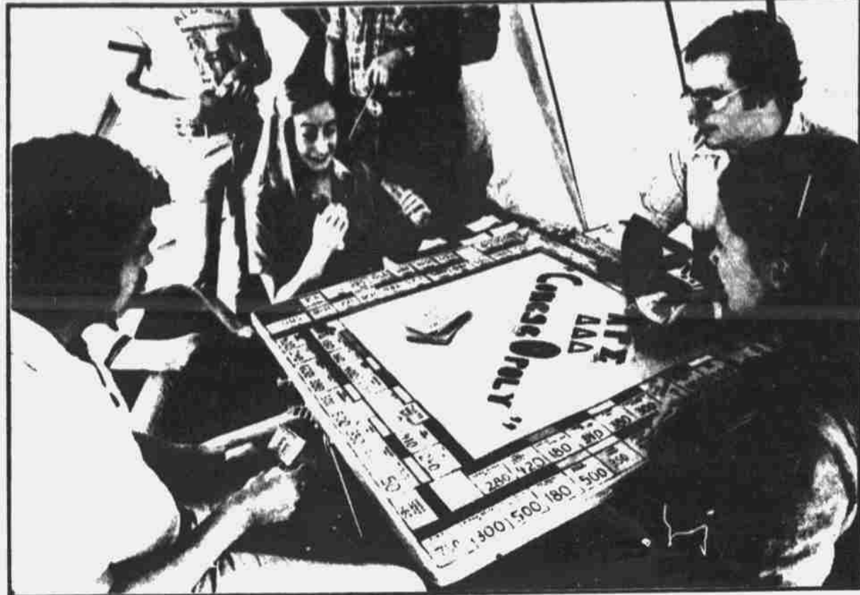
"Collegeopoly," a mock monopoly game will continue until Saturday noon to raise money for the All University Fund. Alpha Gamma Sigma fraternity and Delta Delta Delta sorority are sponsoring the event which sells Regents Hall for $50 and Memorial Stadium for $1500.