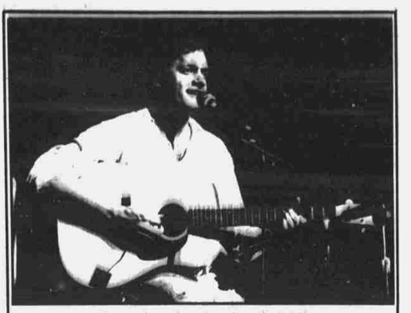
Front Row Productions Presents