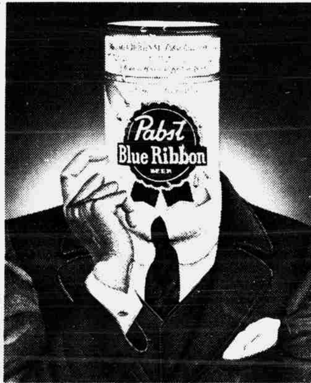
B.M.O.C. "He only had one thing on his mind"

Major: Micro/Macro Economics. "Lack of money is the root of all evil"...chauffered to classes...wears penny loafers with dimes in 'em...Mark Cross luggage...plans to start at the top (of his father's corporation).