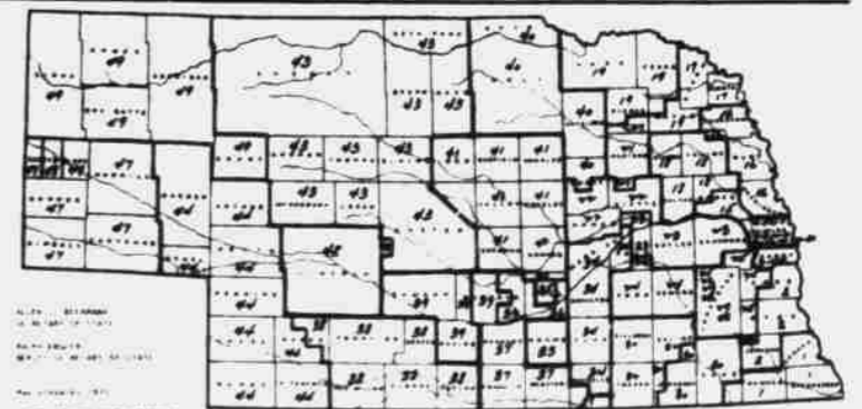
Nebraska legislative districts