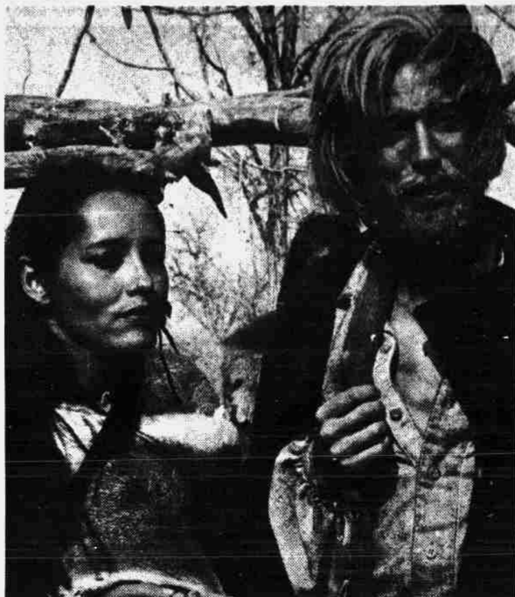
Richard Chamberlin plays the Scots trader Alexander McKeag, who makes known his romantic interest in Clay Basket (Barbara Carrera), the wife of his one-time partner in the second installment of 'CENTENNIAL,' the 26-hour adaptation of James A. Michener's best seller to be telecast on NBC's 'The Big Event,' Sunday, Oct. 8.