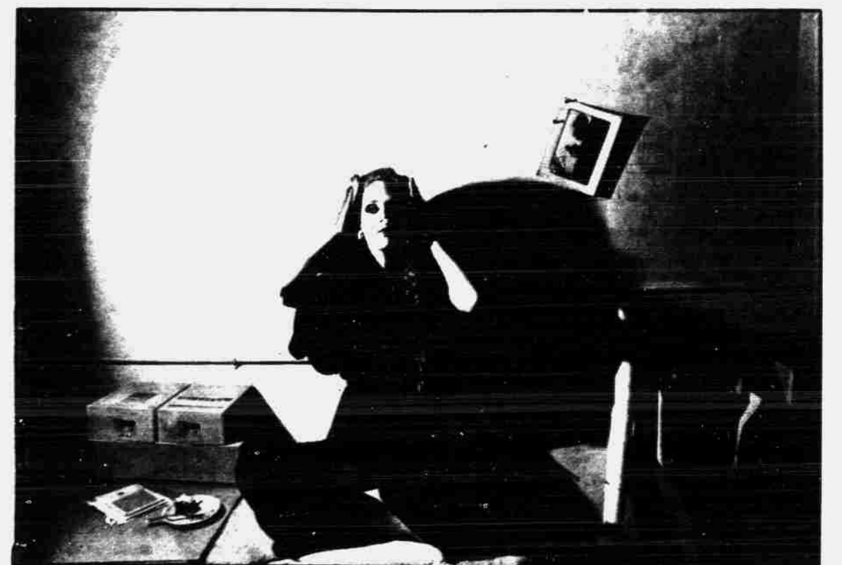
daily nebraskan Fall Fashion '78 - Watch for it Wednesday, Oct 4

Will type papers, etc., medical terminology experience, fast 467-4907, Betty.