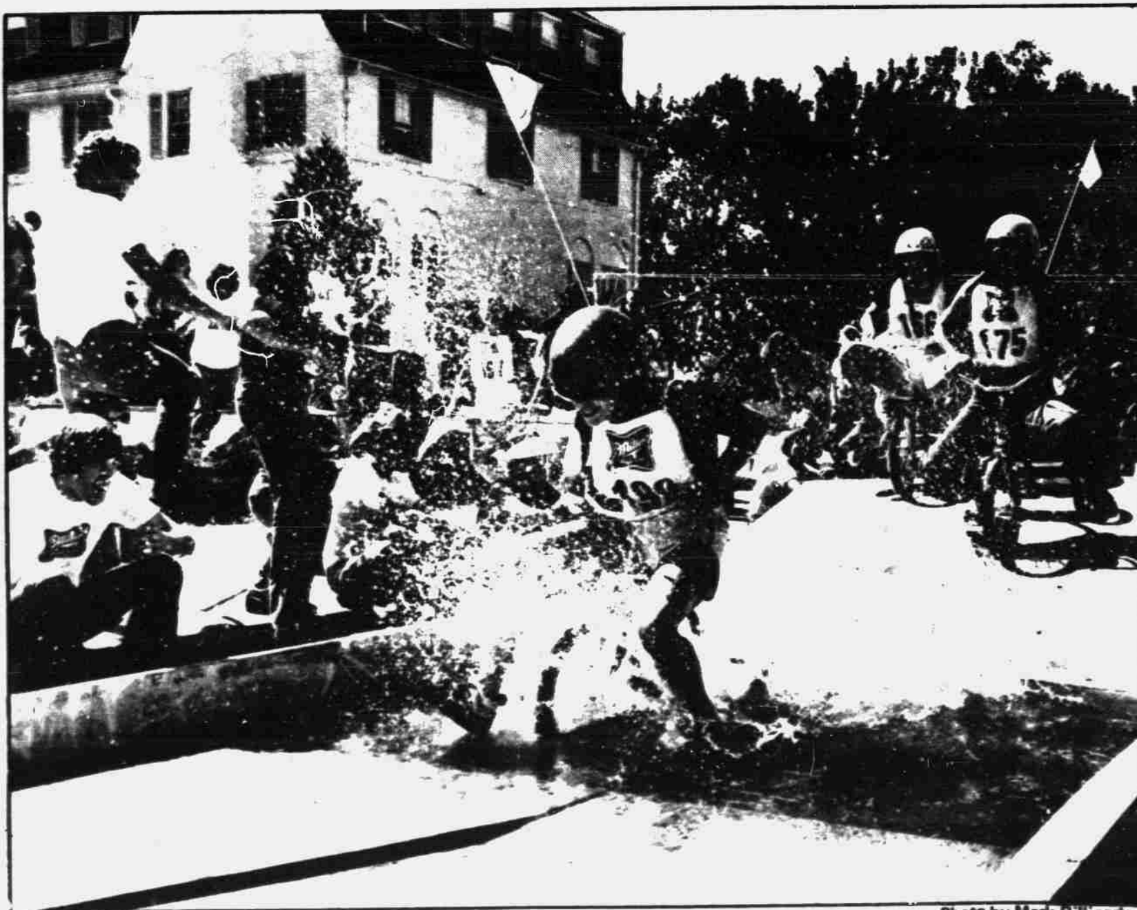
A "motorcycle mama" sorority pledge splashes her way through the water hazard during the first annual Phi Psi 500 Tricycle race Saturday sponsored by Phi Kappa Psi Fraternity. Winners of the event were members of Delta Gamma Sorority.