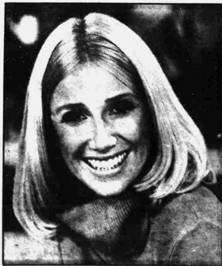
Suzanne Somers does double duty this week, co-starring in the Tuesday, Sept. 12 season premiere of her ABC-TV series 'THREE'S COMPANY' and co-hosting the Wednesday, Sept. 13 NBC-TV special saluting 'THE 25TH ANNIVERSARY OF THE WONDERFUL WORLD OF DISNEY.'