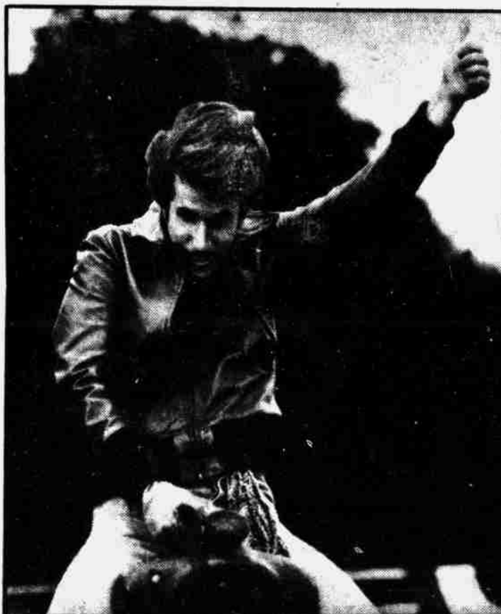
Fonzie (Henry Winkler) gets a taste of the wild west when he and the gang take off to a dude ranch in the special hour-long two-part season premiere of ABC-TV's hit comedy series 'HAPPY DAYS,' beginning on Tuesday, Sept. 12.