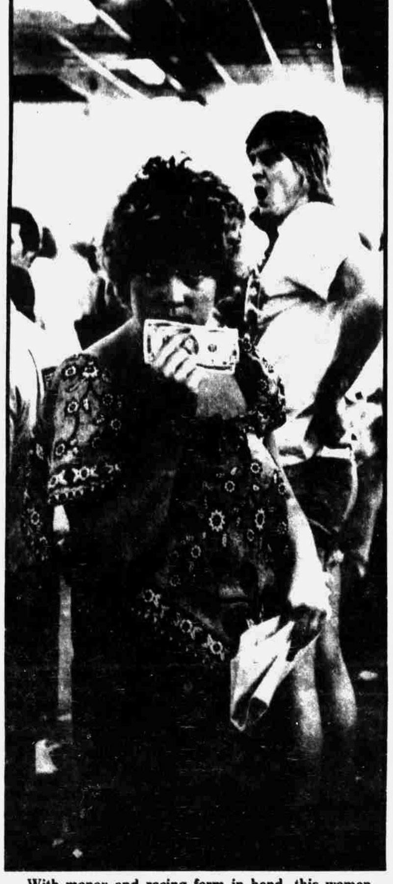
With money and racing form in hand, this woman was one of nearly 5,500 horse racing fans at the fairgrounds Monday for the opening day of races in Lincoln. The races will continue until Aug. 26. See story on page 2.