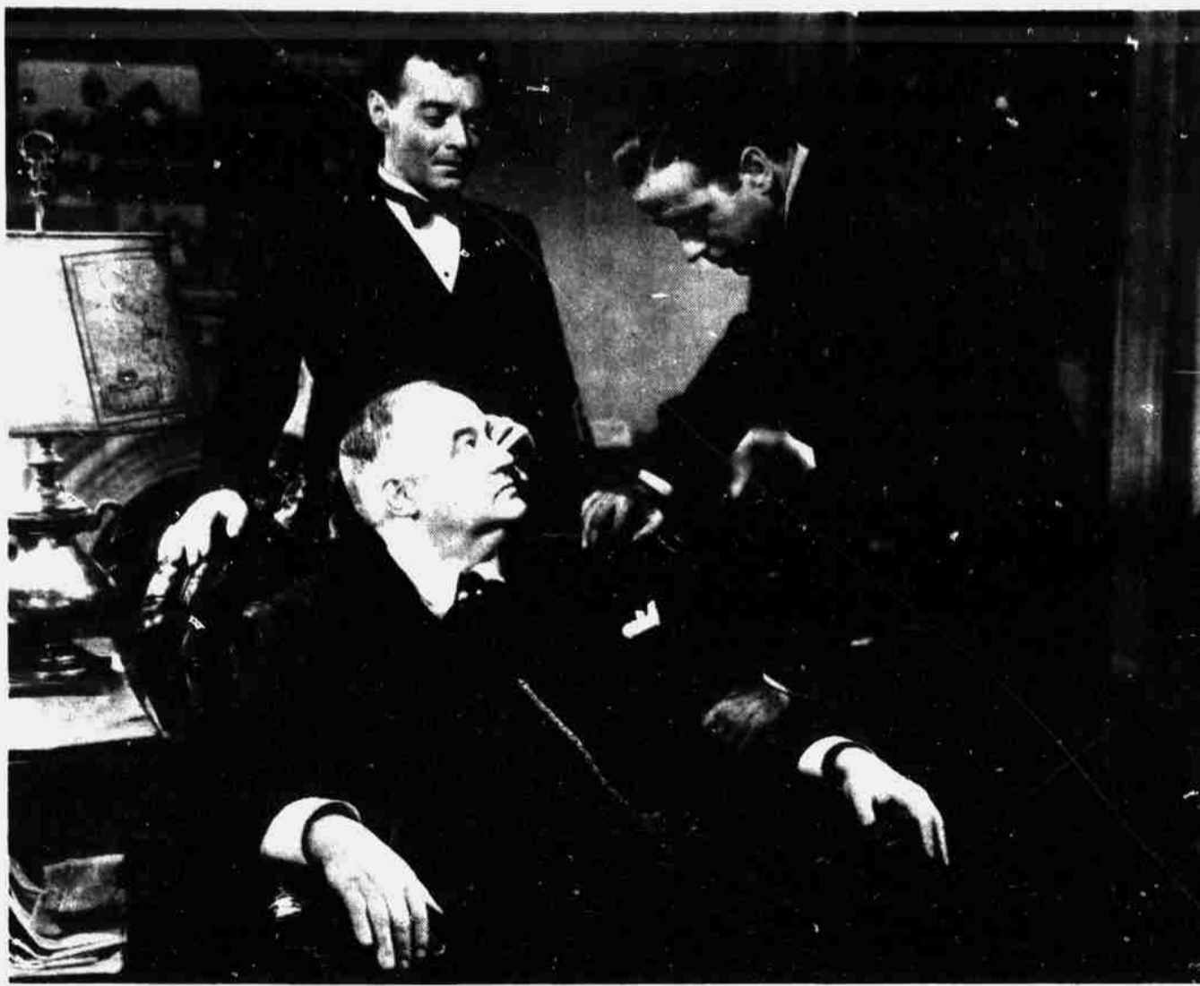
Sheldon Film Festival, "Maltese Falcon"