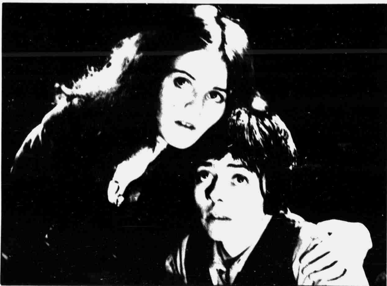
Lesley Dunlop and Jack Wild play Lizzie and Charley Hexam, whose father robs corpses in "Our Mutual Friend," on Masterpiece Theater , Sunday, April 16 at 8 p.m. on the NETV Network.

The "mutual" friend in Dickens' novel is John Harmon who has been left fortune on the condition that he marry Bella Wilfer. He returns home after 14 years under the assumed name of John Rokesmith. He serves as secretary to Mr. Boffin, who is to have the Harmon money if the will's conditions are not fulfilled.