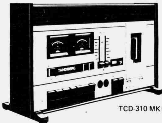
TCD-310 MK II

Save before the March 6th price increase. Plus extra savings on Maxell tapes!