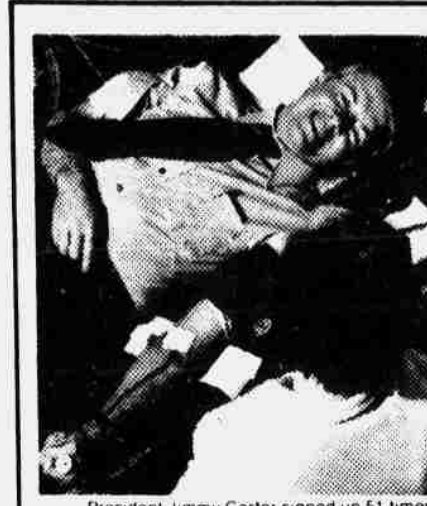
President Jimmy Carter signed up 51 times

STEREO WAREHOUSE 110 NEW ALLEY, STATE COLLEGE, PA. 16801