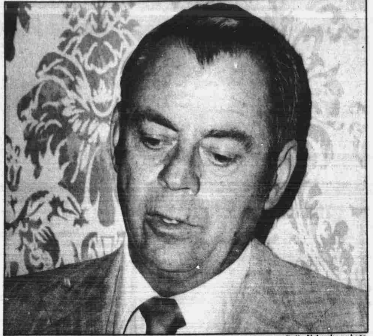
John Ralston, former head coach of the NFL's Denver Broncos, said he quit because of sickness and fatigue. "The fans were sick and tired of me."

Ralston lives in Denver and travels around the country doing promotional work for Dale Carnegie Courses.