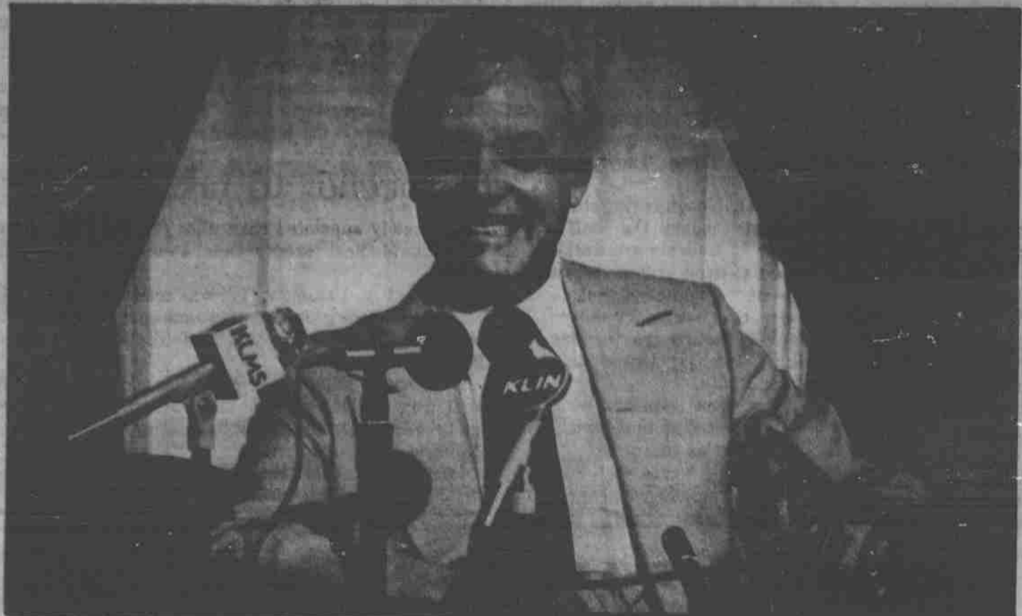
Former state governor Norbert T. Tiemann

But it is important for the state to balance its senate representation by sending a Republican to Washington in 1978, he added.