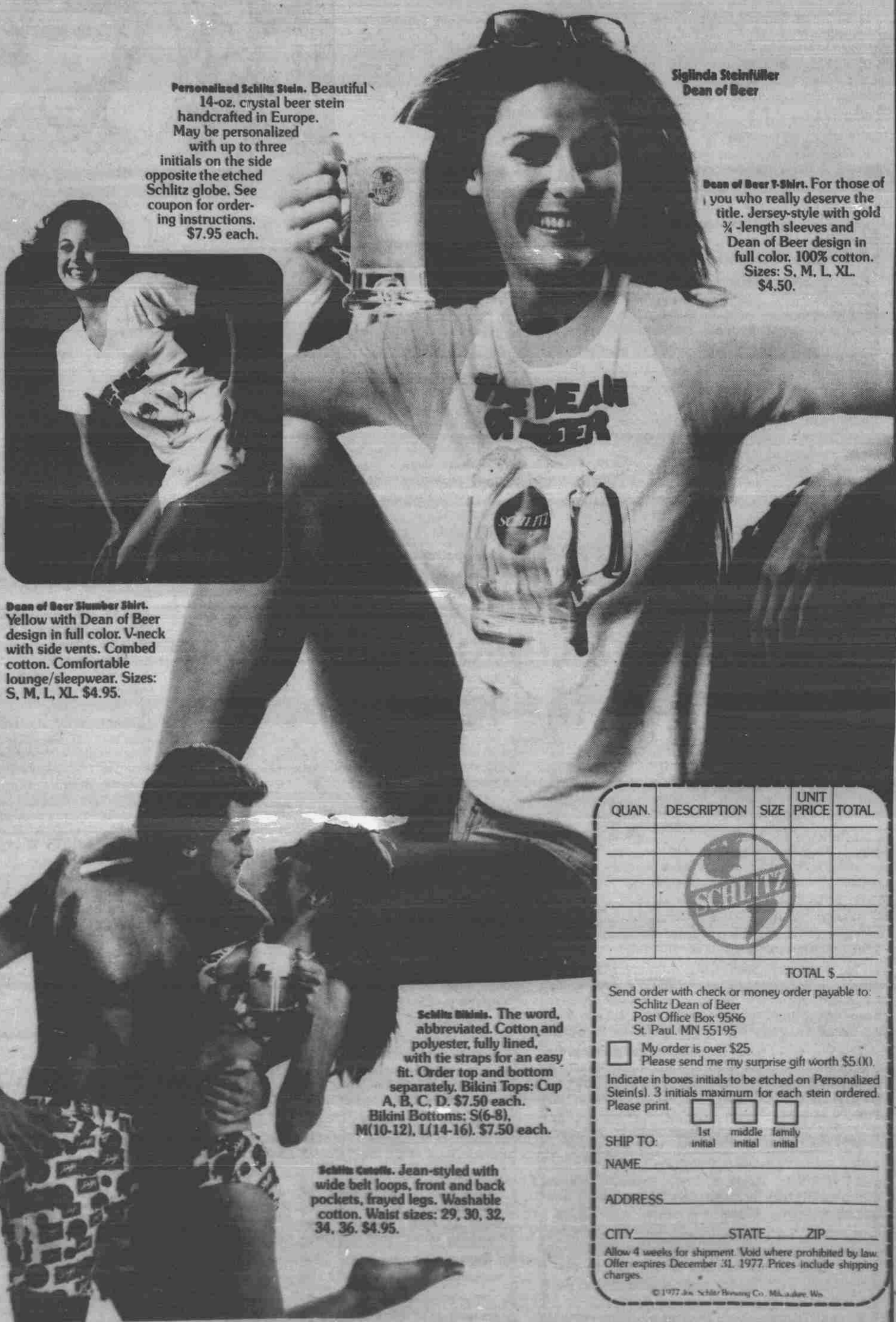
Siglinda Steinfüller Dean of Beer

Personalized Schlitz Stein. Beautiful 14-oz. crystal beer stein handcrafted in Europe. May be personalized with up to three initials on the side opposite the etched Schlitz globe. See coupon for ordering instructions. $7.95 each.