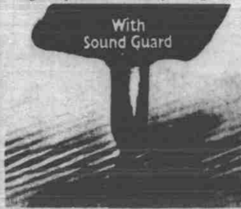
With same magnification, record vinyl shows no wear.

If you've played any record often enough, you've heard the inevitable occur. It wore out.