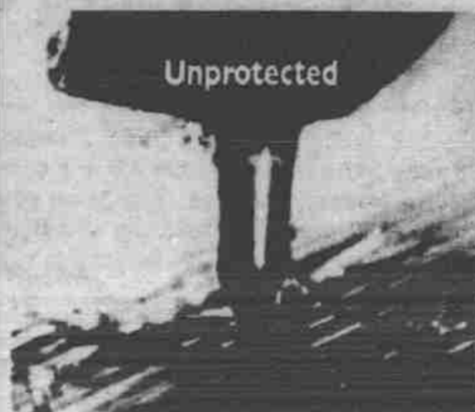
Magnified, you can see record vinyl wearing away.