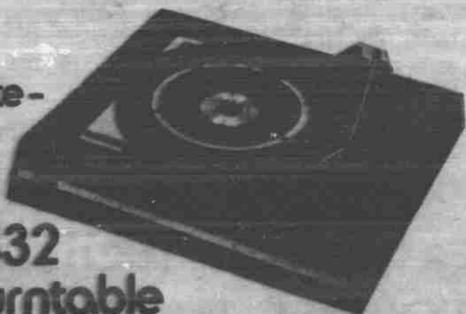
BSR 432 Turntable