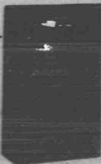
Pr. of Utah Speakers PV 200 or PV 300