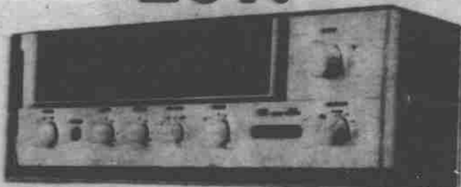
Sansui 221 Receiver