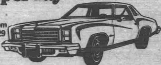
Rent a car like this Monte Carlo or similar-sized car

Plus 10 cents per mile from 11/24 through noon 11/29